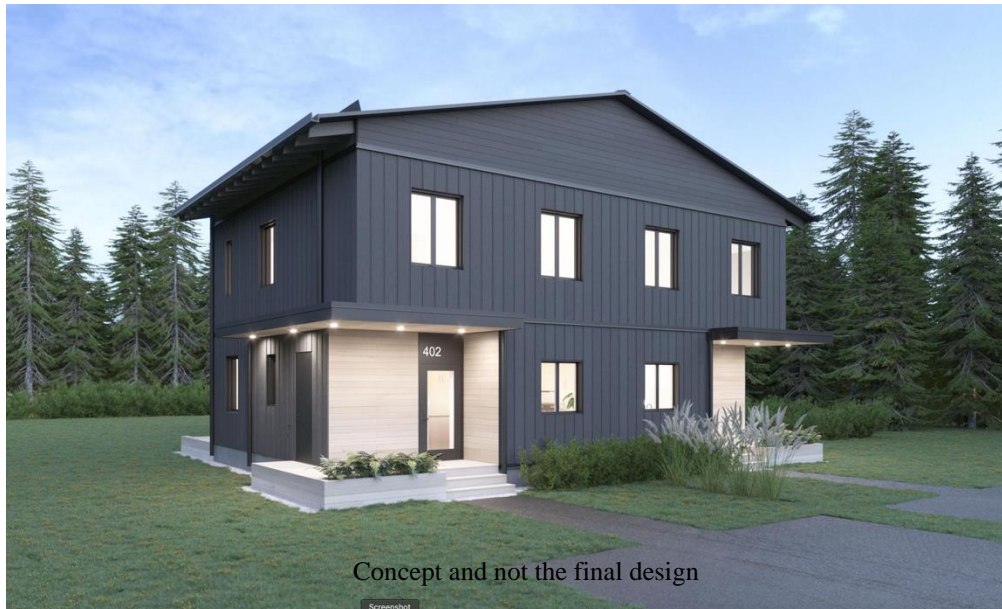
Concept and not the final design