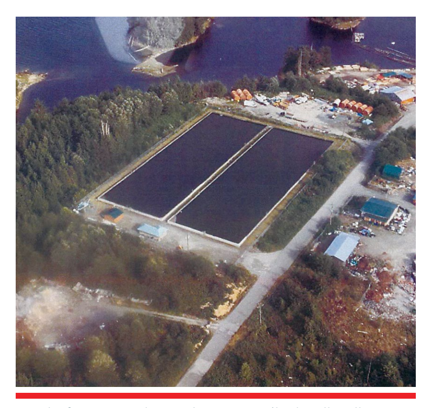
Sample of Concrete Tank Aerated Lagoons—Heiltsuk (Bella Bella)